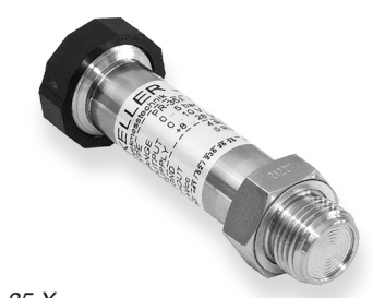
Series 35 X G1/2", flush diaphragm