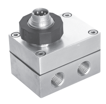
Low Pressure Version

So that the differential pressure can also be measured exactly if the standard pressure range/differential pressure ratio is high, this series also features the tried-and-tested microprocessor-based technology that is used in Series 30 X. All reproducible pressure sensor errors (i.e. non-linearities and temperature dependencies) are entirely eliminated thanks to mathematical error compensation. The sensor signals are measured with a 16-bit A/D converter, so the individual standard pressure ranges can be measured to an accuracy of 0,05%FS throughout the entire pressure and temperature range.